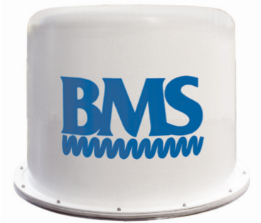
2 GHz, 6 GHz