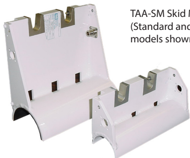
TAA-SM Skid Mount (Standard and Hi-Lift models shown)