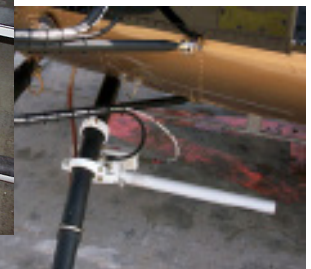
Cross-Tube Mount, TAA-CTM