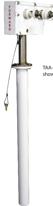
TAA-101 Antenna Actuator shown with BMA-6-O antenna